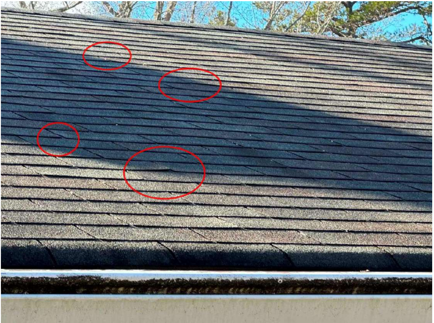
5 5-IMG_0818 Damaged Shingles