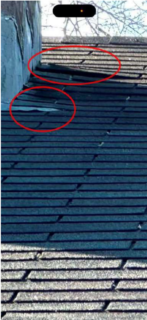
6 6-IMG_0821 Damaged Shingles