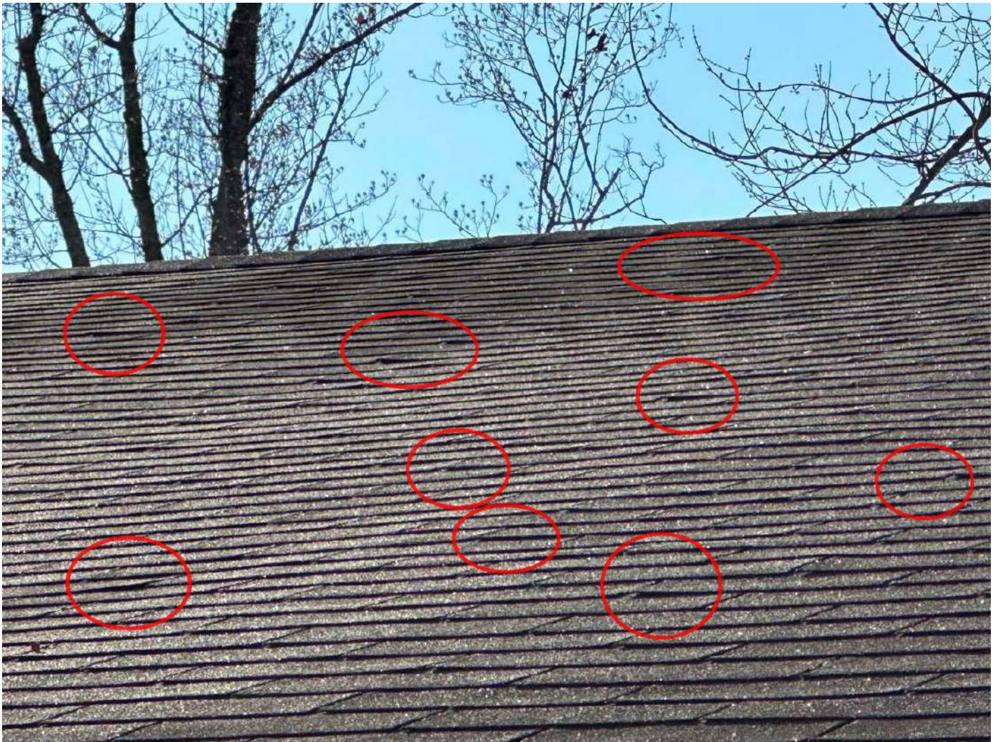
4 4-IMG_0813 Damaged Shingles