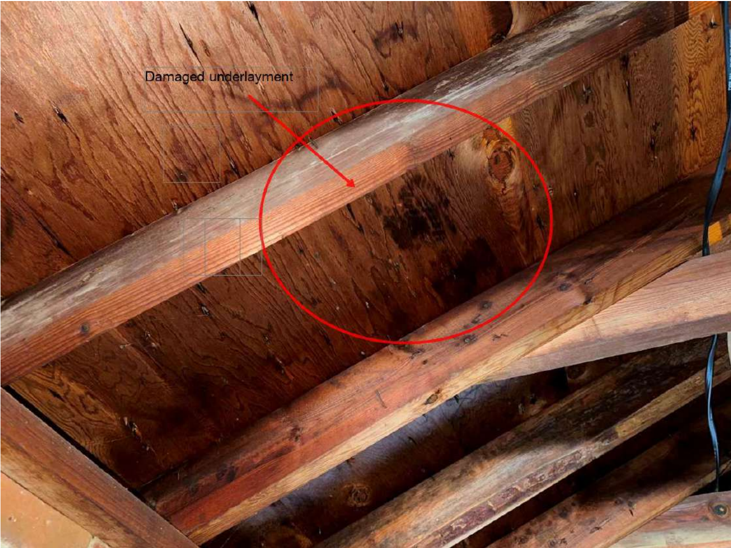
1 1-IMG_0802 Date Taken: 12/23/2022 Water Damaged underlayment.